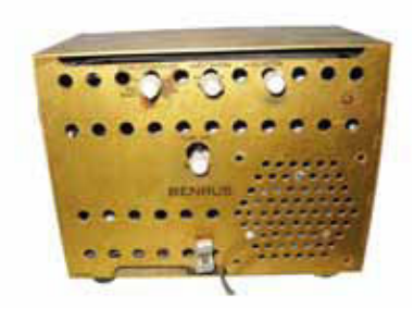
Benrus Model 10B01 Clock Radio – Metal cabinet AM radio with alarm clock. Manufactured in 1955. Uses five tubes. Christina Morelli, Great Falls, MT