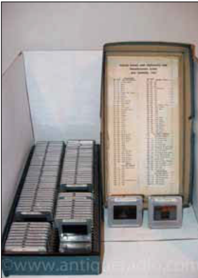
Original Philco Slide Box – Where it all started.