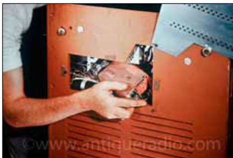
Inserting UHF Tuner – A service tech installing the optional UHF frequency tuner.

...find out how by visiting us today at www.antiqueradio.com .