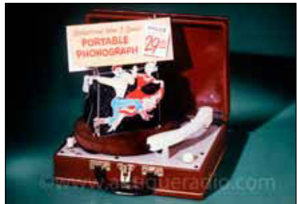
Model 1332 Turntable Display – How to set up in-store display, explaining the three-speed feature and $29.95 price. Amplifier consists of one tube.

...find out how by visiting us today at www.antiqueradio.com .