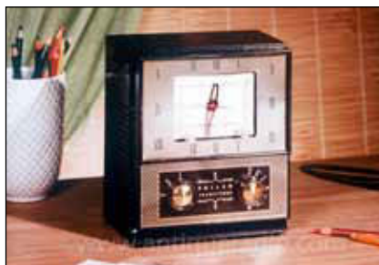
Model 720 – Transitone series clock radio combination. Tuning range: 540 to 1630kc; power supply: AC; Tubes: five.