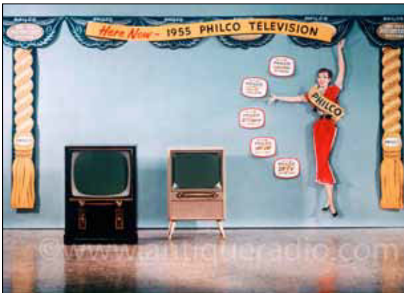
TV Window Kit – How a store window display should be set up to promote TV sales.