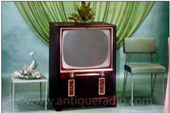
Model 6112 – TV with 24-inch CRT and new “Finger Tip Tuning System.”