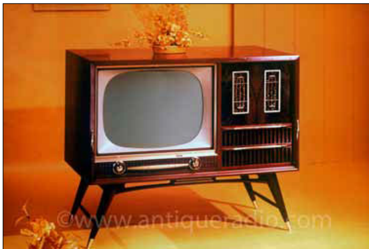
Model 4412 – TV with 21-inch CRT, three-speed record changer, and AM radio. Record changer is concealed in a pull-out drawer and the radio is hidden under a panel on the top.