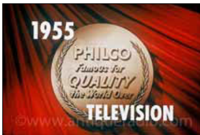
Television Title Slide