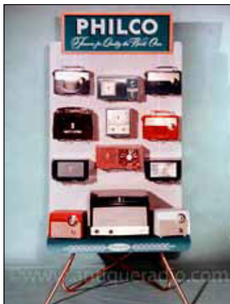
Radio Merchandiser – Point of sale display showing 12 of the latest Philco radios.