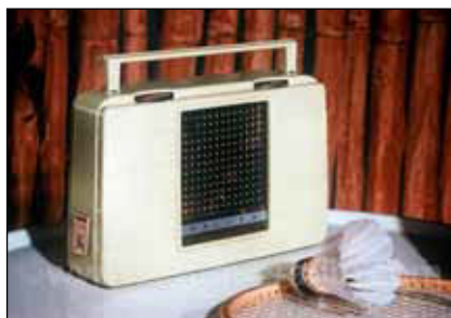
Model 660 – Tuning range: 540 to 1630kc. Power supply: battery, 1.5 volts and 75 volts; tubes: four.