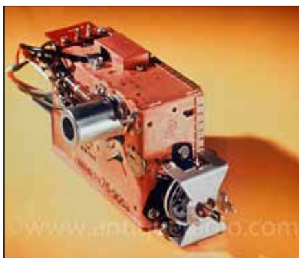
UHF Tuner – Close up of the optional new UHF frequency tuner.