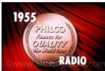
Radio Title Slide

Look for more in the future. And, remember, you can see these in full color on the A.R.C. website. Coming up, we hope to have the entire slide show on the site.