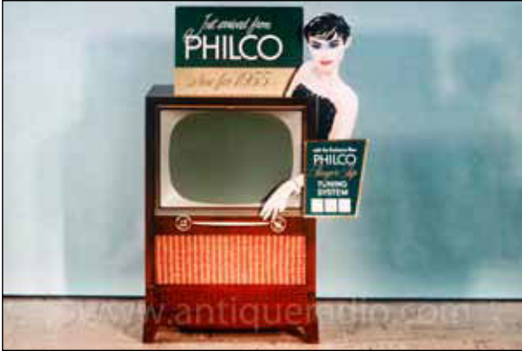
Finger Tip Wrap – Point of sale display illustrates the “exclusive” new finger tip tuning system.