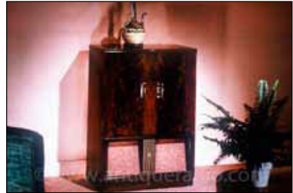
Model 1755 Closed – Hi-Fi system's attractive cabinetry.