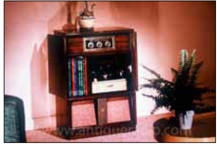
Model 1755 Open – Hi-Fi system consisting of three-speed record changer and a three-tube, 6 watt audio amplifier.