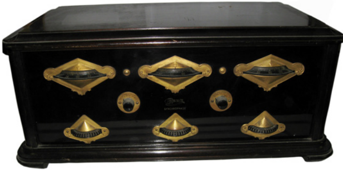
Grebe Synchronphase model MU-1 – (Above and right) Battery set manufactured in 1925 by Grebe, located in Queens, NY. Has the original instruction sheet and station log. Samuel Smith, Cohoes, NY