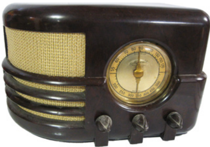
Majestic model 651 – Manufactured by Majestic in 1937. Came in a white or black plastic cabinet. Marc Doobie, Fayetteville, AR