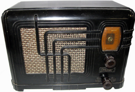
Fada model 260B – Black Bakelite made in 1936. Came with Bakelite back cover molded with the FADA name. Arthur Salsberg, Palm Beach, FL