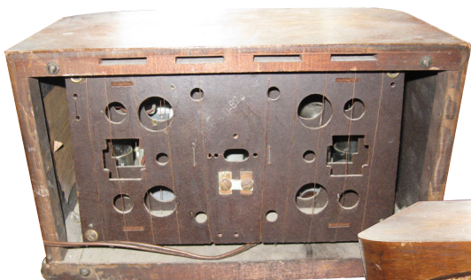
Zenith model 6D628 radio – Interesting grille work on this 1942 radio. Covers the AM band with six tubes. Runs on both AC and DC power. Robert Brettschneider - Queens, NY.