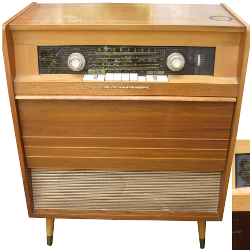
Grundig Majestic model M1PX – manufactured in Germany in 1958. This six tube mono radio/phonograph console covered the AM, FM, and shortwave bands from 6 mc to 16mc. The record changer is marked Grundig and came with the 45 RPM record spindle. Roger Smith – Lawrence, KS.

This column presents in pictorial form many of the more unusual radios, speakers, tubes, advertising, and other old radio-related items from our readers' collections. The photos are meant to help increase awareness of what's available in the radio collecting hobby. Send in any size photos from your collection. Photos must be sharp in detail, contain a single item, and preferably have a light-colored background. A short, descriptive paragraph MUST be included with each photo. Please note that receipt of photos is not acknowledged, publishing is not guaranteed, and photos are not returned.