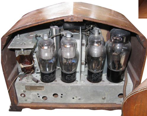
Emerson model 250-AW – manufactured in 1933. This is a five tube radio that covered AM and short wave. It has two knobs in front and the band switch in the rear. Jerry Fulcrum - Sioux Falls, SD.